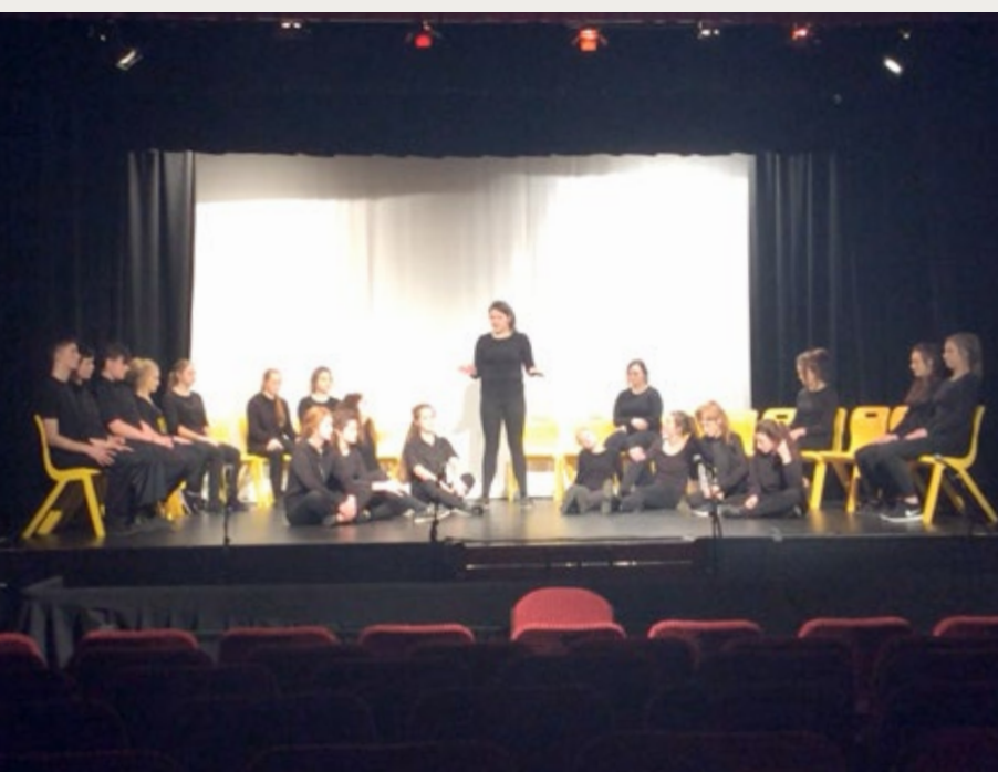
Coláiste Mhuire students on stage in The Briery Gap Cultural Centre, Macroom.

Students of Coláiste Mhuire, Buttevant were crowned overall winners of the 2016 All-Ireland Transition Year Drama Festival. The annual festival, now in its sixteenth year is aimed at encouraging the artistic skills of students during the non-exam year.