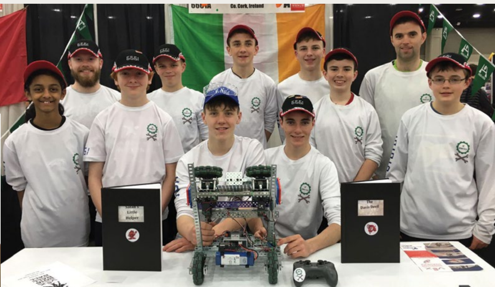
The Davis College Vex Robotics Team proudly represents Ireland at the World Championships in Kentucky, USA.

Davis College students, who won the National Vex Robotics championships at CIT earlier this year, were rewarded with the opportunity to represent Ireland last month at the World Vex Robotics Championships in Kentucky, USA. This trip was the college's third such event in four years, following earlier competitions in Los Angeles in 2013 and 2014. Davis College Mallow competed among the top 1,100 international teams and cemented their place as one of the leading centres for robotics in the Irish post-primary sector. The VEX programme is designed to nurture curious and scientific minds by enabling students to construct robots to compete with other robots in performing various tasks in a match setting. The students involved performed very creditably in the competition. They gained practical experience in computer coding, engineering and construction and also developed such important 'soft skills' as team work, co-operation, planning and project management.