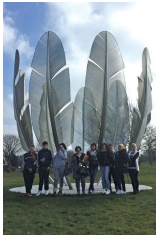
Student Art Trip to Midleton