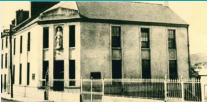
The old vocational school in Skibbereen which was replaced by Rossa College