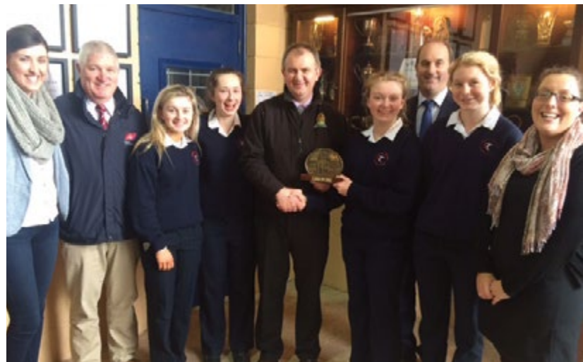
Coláiste Treasa Angus Beef Winners