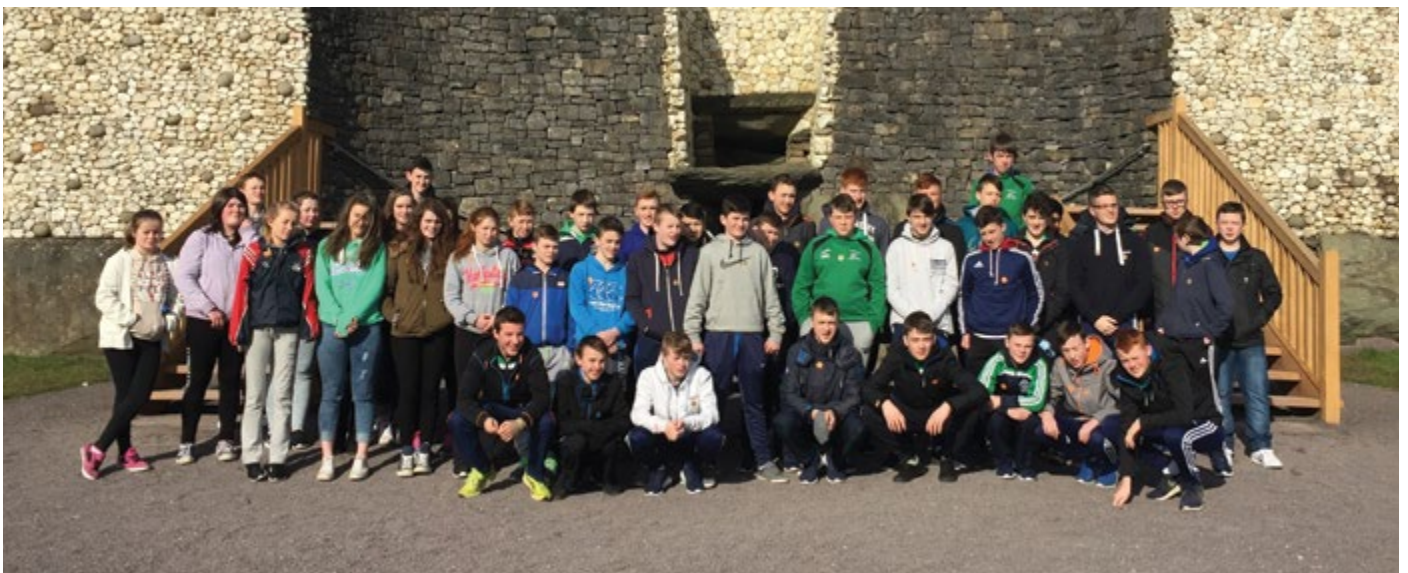
Students at Newgrange

Second year students from Maria Immaculata Community College recently travelled to Wicklow, Dublin and Meath on a 3 Day Geography Fieldtrip. The students visited St. Kevin's round tower in Glendalough, Dublin Castle, Trinity College, National Museum, The Viking Splash and Newgrange in Co. Meath. It was a very hectic, but enjoyable trip. All 54 students were a credit to their school and families displaying exemplary behaviour throughout the three days.