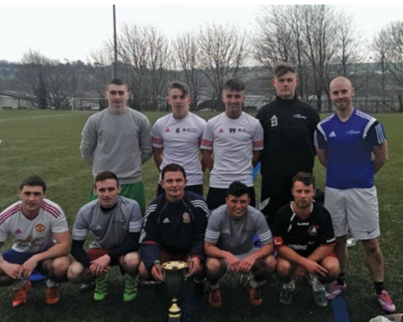
The victorious CSN team

Cork ETB hosted a very successful Employer Engagement Breakfast in the Clarion Hotel on Wednesday 3rd February for the Hospitality sector in Cork city, which was attended by approximately 40 employers. These events provide employers with an opportunity to gain an overview of what Cork ETB can do for them in terms of education and training, as well as allowing Cork ETB to listen to employer views, ensure awareness of skills needed and informing the Education and Training Plan for 2016.