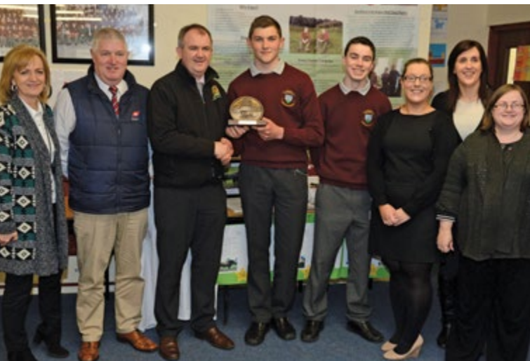
St. Brogan's College Angus Beef Winners.

Students entered the five stage competition in November and progressed to the final stage of the competition where they presented their ideas to judges in Croke Park. The calves will be presented at the Ploughing Championships in September 2016. The calves will be reared to slaughter over the following 18 months and then slaughtered in one of the ABP or Kepak plants. Students will submit a final report on the experience of rearing their animals and one overall winner will receive a further prize of €2,000. The success of Coláiste Treasa and St. Brogan's follows that of Coláiste Pobail Naomh Mhuire, Buttevant last year in the same competition; students there are currently in the process of rearing their Angus calves.