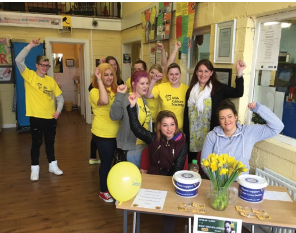
Youthreach Bandon was proud to raise over €1000 for Daffodil Day