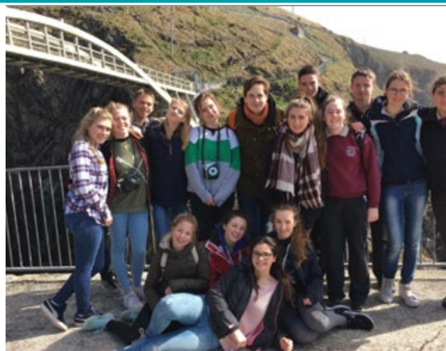
Right: Students from Schull Community College with their exchange partners from Baarnsch Lyceum, a 1,000 pupil school south of Amsterdam, at Mizen Head Bridge, West Cork.