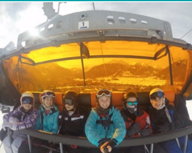
Left: Schull Community College Transition Year students in Ehrwald, Austria for their ski trip.