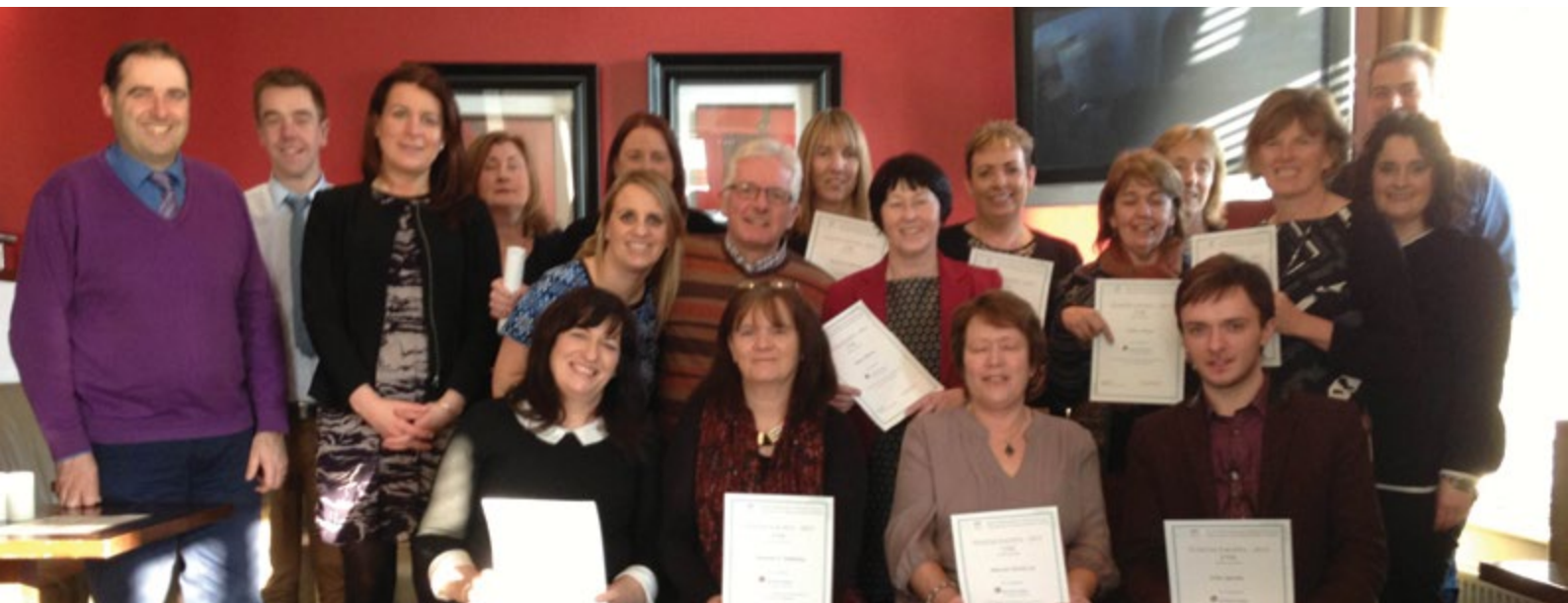
Adult educators from Cork ETB who graduated from the Instructional Leadership Programme