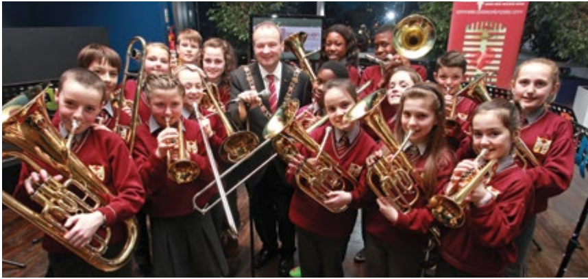
The Holy Cross N.S. Brass Ensemble pictured with Lord Mayor Cllr. Chris O'Leary. Cork Academy of Music in partnership with Music Generation Cork City.